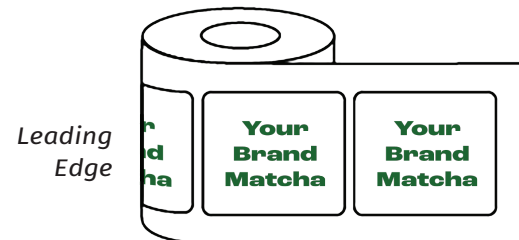
Direction #3 - Outside Wound, Right Side First

When you have your label printed, please request Direction #3 (Outside Wound Right Side First) . The roll direction describes how your labels are oriented as the roll of labels unwinds. The orientation is important when applying labels by machine.